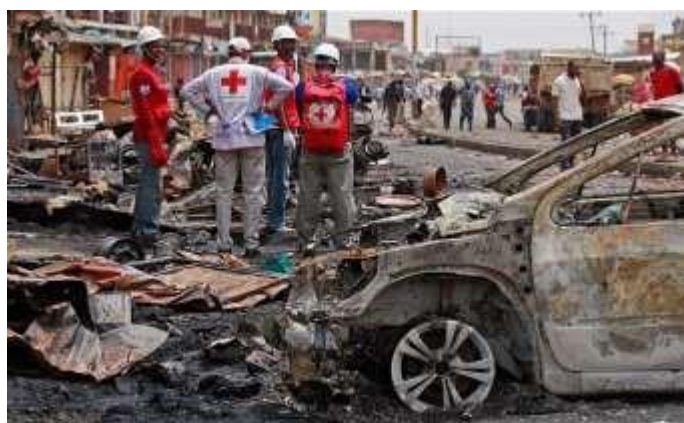
Figure 2: Destruction due to the activities of Boko Haram

Originating in the north-eastern part of Nigeria, the Boko Haram insurgency has been ongoing for the past nine years, rapidly spreading to other parts of the country as well as to a large portion of the Lake Chad Basin (Assanvo, Abatan, & Sawado, 2016). The devastating consequence of the activities by Boko Haram was alarming. The modus operandi of this terrorist group includes among other things, attacks on churches, their clergy, and their faithful through suicide bombings, gun attacks, kidnappings and rape (Kpughe, 2017). At a later of their operation, mosques (the Muslims’ worship centre) were attacked during prayers with the suicide bombers pretending to be fellow worshippers. Several deaths have occurred as a result of this strategy of the dreaded terrorist group. Beginning in Nigeria and exported to other countries within the Lake Chad Basin Commission is an indication of the rapid spread of evil across borders. The activities of Boko Haram has led to the death of more than 51,567 people and the displacement of about 2,400,000 people across the North – Eastern part of Nigeria between 2010 and 2016 when the activities of the group became widespread (IOM, 2016; The Telegraph, 2015; Africa Check , 2014; IDMC, 2018; Campbell, 2018; Council on Foreign Relations, 2018).