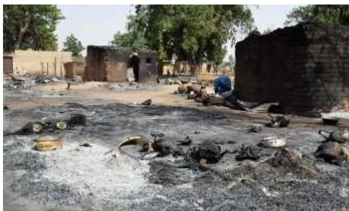
Figure 4: Herders–Farmers’ crisis in Southern Kaduna