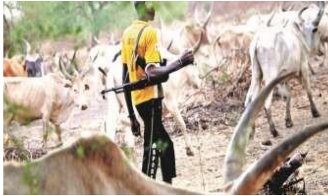
Figure 3: A typical picture of an armed herder