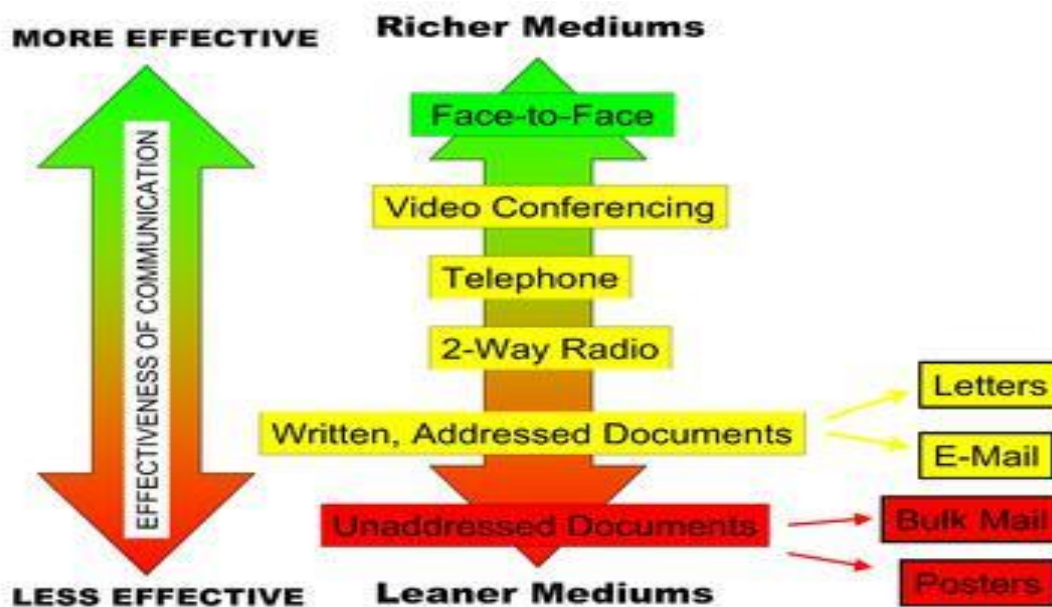
Figure 2: Channels for communication and their effectiveness

There are several communication channels available to a modern organization with differing levels of effectiveness and use. For internal communications, the diagram below depicts the various channels available and the effectiveness of each channel.