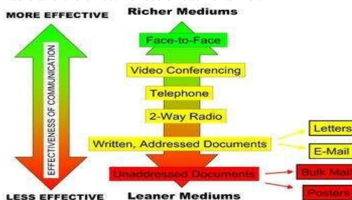
Figure 2: Channels for Communication and their Effectiveness

In organizational communication research, some main components of the systems theory have been identified which informs how effective communication leads to employee performance namely; wholeness, hierarchical and feedback. In systems theory, the whole determines the character and functions of parts (Weckowicz, 2002). Wholeness refers to the interdependence of the various elements that constitute the system. This means that individual parts of a system contribute to the existence of the organization. Conferring to Miller (2009) the concept of an organizational structure indicates that, the relations within an organism are systematized by order of hierarchy rules. In this regard, components in the main systems are designed into subsystems; making up the whole system, which itself operates within a larger environment. There are several communication channels available to a modern organization with differing levels of effectiveness and use. For internal communications, the diagram below depicts the various channels available and the effectiveness of each channel.