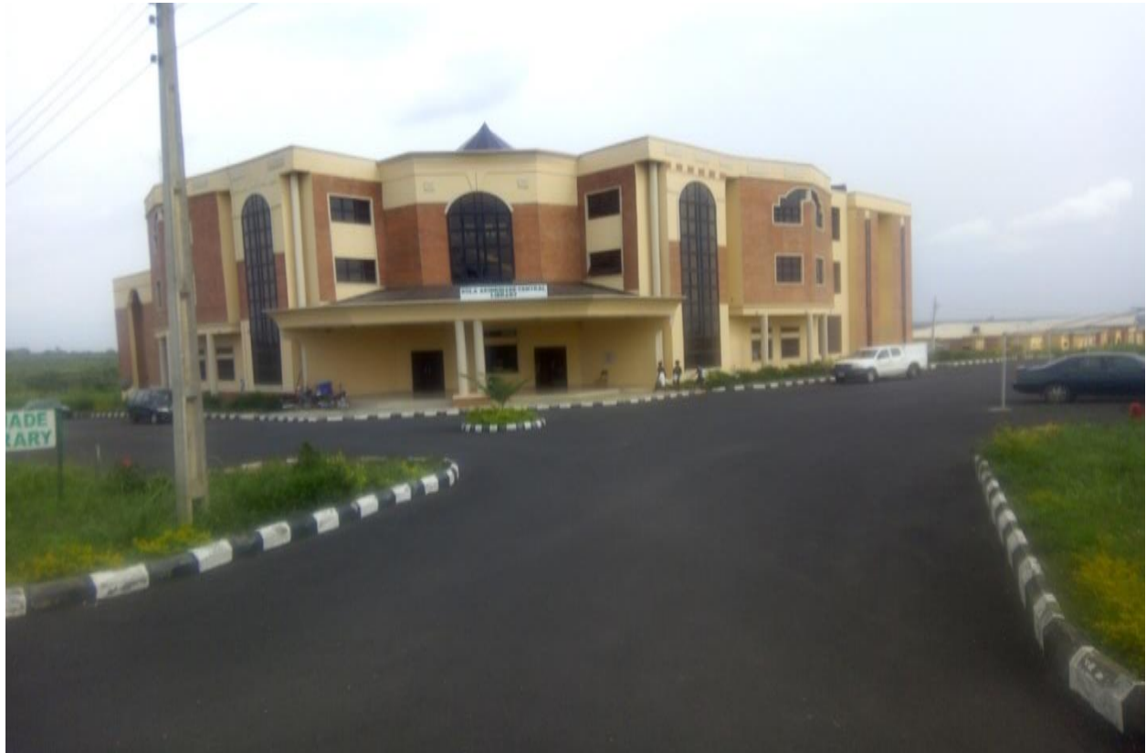
Picture i: UNIOSUN Main Library Building, Osogbo (Sola Akinrinade Central Library)