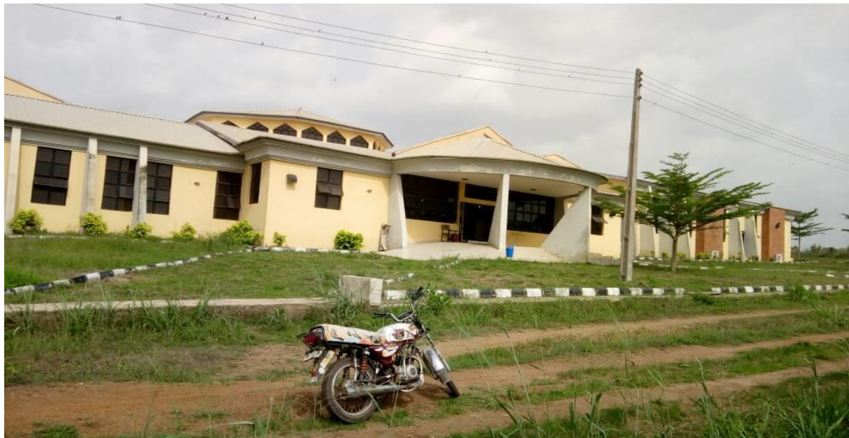
Picture ii: Ikire Campus Library (A replicate of other campus libraries: Okuku, Ipetu-Ijesa, and Ejigbo)